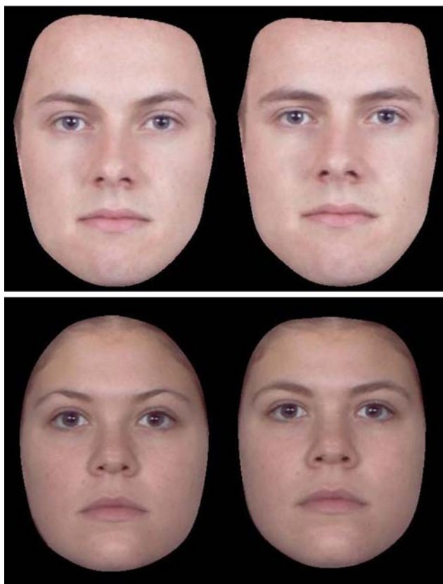
Fig. 1 Display of an example of masculinized ( right ) and feminized ( left ) versions of male ( top ) and female ( bottom ) faces used in this study. Although this is a global manipulation of the differences between male and female faces, key features that relate to sexual dimorphism are eyebrow size, jaw shape, and eye size, among other features (Perrett et al., 1998; Perrett, May, & Yoshikawa, 1994)